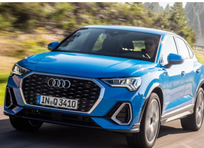
Audi Q3 Sportback

Fuel/power consumption and CO 2 emission figures as well as the efficiency classes can be found on page 47.