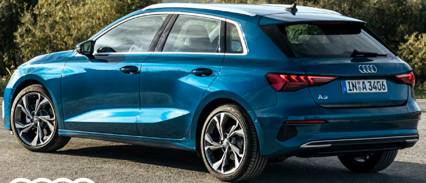
Audi A3 Sportback