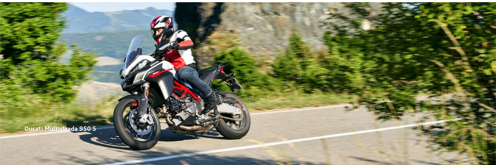
Ducati Multistrada 950 S

Fuel/power consumption and CO 2 emission figures as well as the efficiency classes can be found on page 47.