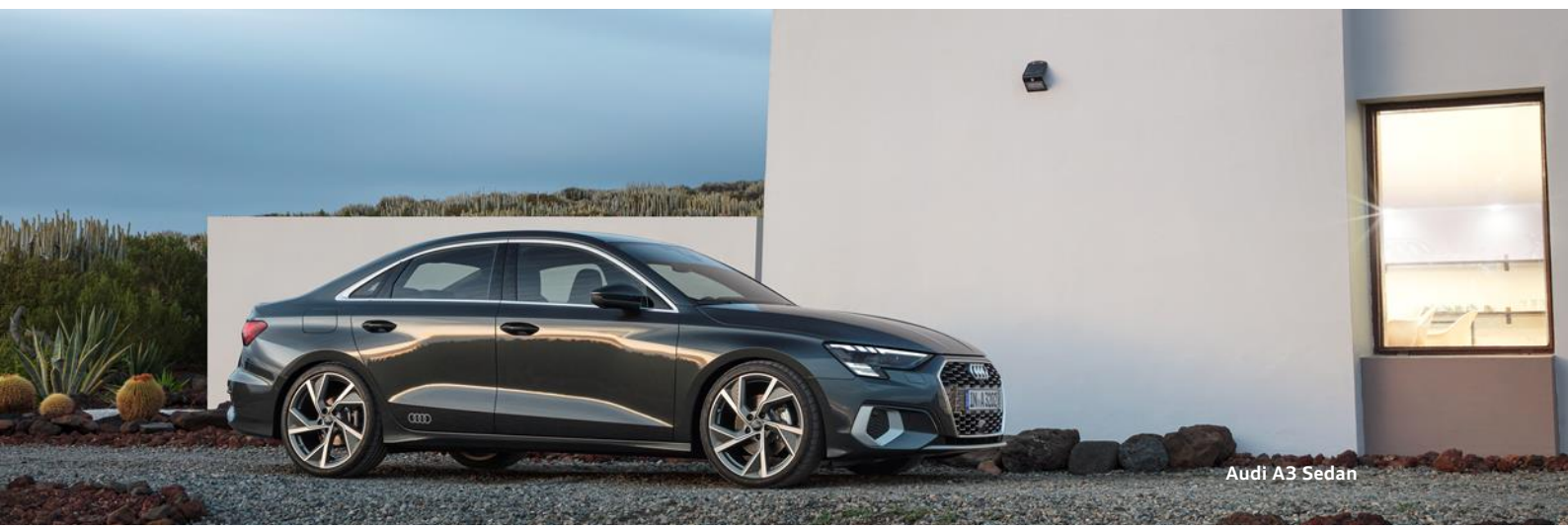
Audi A3 Sedan

Fuel/power consumption and CO 2 emission figures as well as the efficiency classes can be found on page 47.