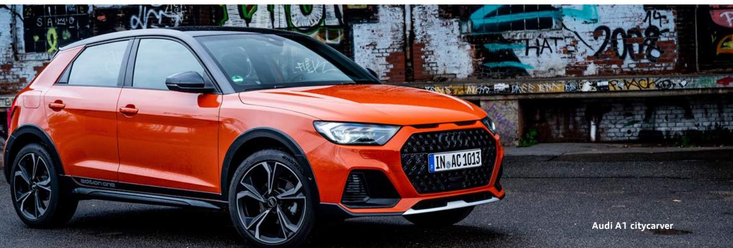
Audi A1 citycarver

Fuel/power consumption and CO 2 emission figures as well as the efficiency classes can be found on page 47.