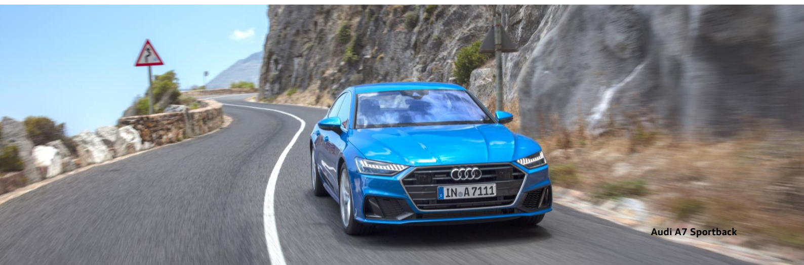
Audi A7 Sportback

Fuel/power consumption and CO 2 emission figures as well as the efficiency classes can be found on page 47.