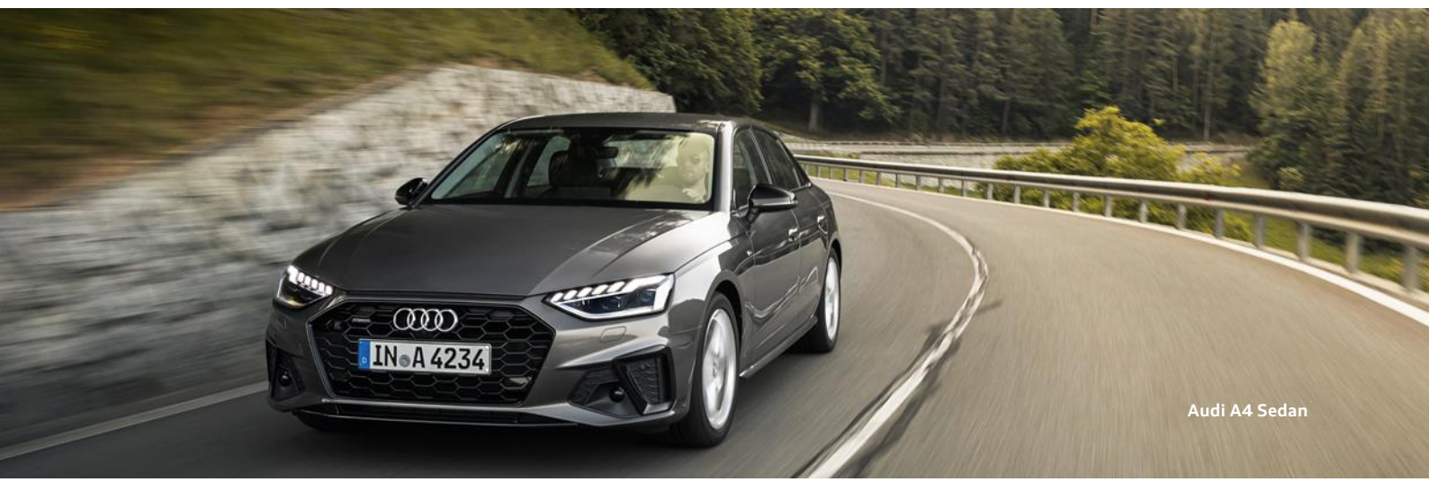
Audi A4 Sedan